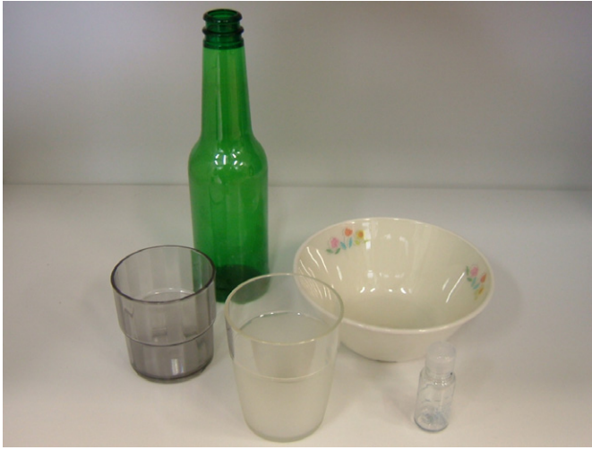
Fig. 1: Photograph of a dinner set composed of polyethylene naphthalate.