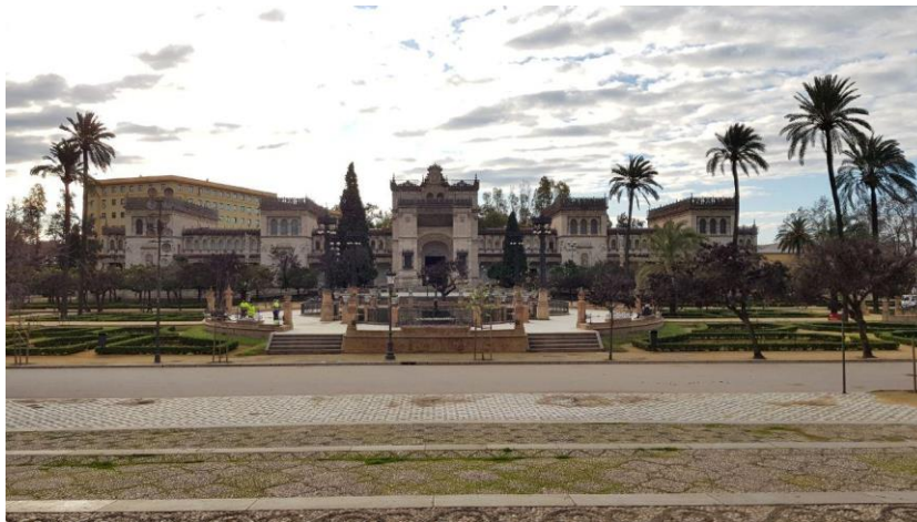
Figure 3. Seville Archaeological Museum at the America Square

On the other hand, with its presence today, the museum recalls this event of national and international impact, perpetuating its image. The use as headquarters of a state museum institution makes this effort to achieve a representativeness of its image and the sense of meeting place of its spaces. The exhibition purpose of the building remains, being in origin temporary and now starred by an important permanent collection of archaeology. Similarly, both destinations share that they were and are support for urban cultural tourism. This is an increasingly widespread and socially present reality.