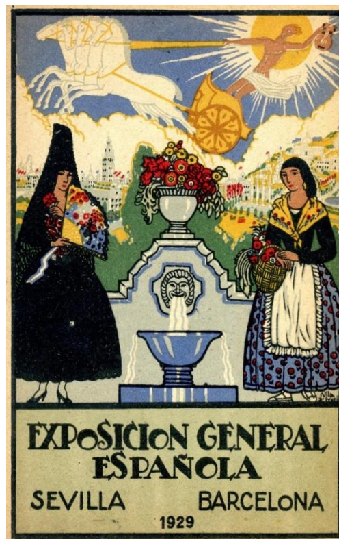
Figure 1. General Spanish Exhibition: poster.

museum experiences served to create the first 19 international exhibitions (1851-1928) [3]. The architecture of the pavilions imported many precepts of museum architecture, although shaded by its vocation to be ephemeral. In general, at the end of these exhibitions, most of the pavilions were dismantled or demolished, with very specific cases in which they were reused. In this sense, the case of Seville is quite relevant because of the large number of buildings that have been preserved and adapted to new uses.