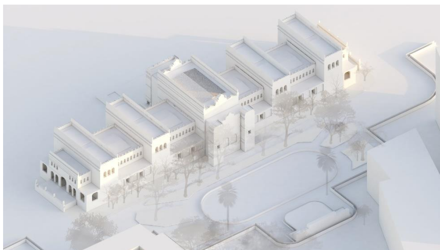
Figure 4. Current volumetric definition of the Seville Archaeological Museum (rendering by the authors)

At the time when the Archaeological Museum of Seville was installed in its definitive building, this meant a reuse of a large building that did not seem to imply major changes. To a large extent, this was due to the little development of the institution in particular, as well as to the little technification and normativization that the museums had by then.