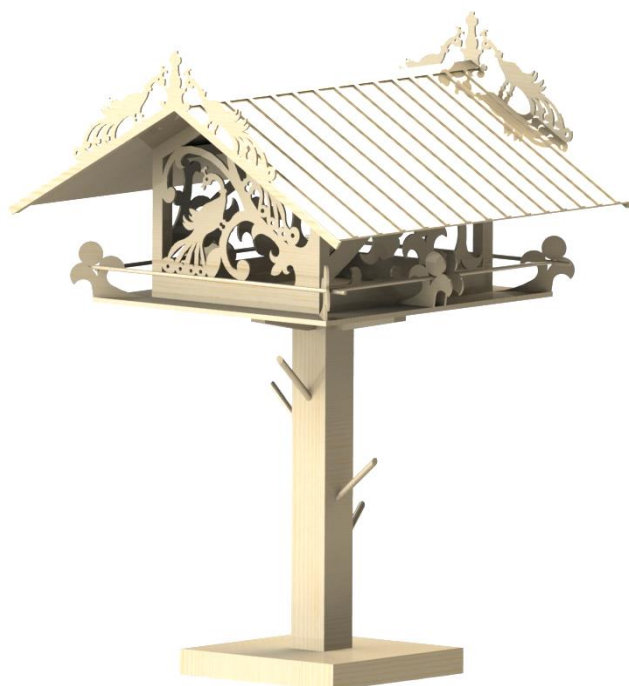
Figure 3. Feeder made after wooden architecture of Tomsk. (Design Fedorenko E)

The analysis has showed [10, 11] that the most effective material for the feeder is wood and plywood. This feeder has the following design solutions that provide the required functions of the feeders: bird watching, additional food for birds, operational and aesthetic functions are given in table 1.