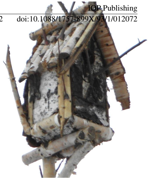
Figure 2. Designer window-type feeder (Design Toichkin A)

According to the principles of aesthetic perception, and considering feeder from the position of birds usability we have proposed a number of parameters which satisfy the requirements.