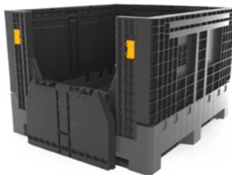
Figure 3. Industrial collapsible bulk containers.

Recently collapsible bulk containers are universal in manufacturing in modern automotive industry. Bulk collapsible containers are used to transport and store components, parts, raw materials, scrap, and could be used in assembly line (figure 3).