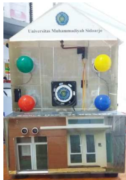
Figure 2. Smarthome Prototype

The appearance of the Smarthome Prototype along with the Smartphone Application that has been made is shown in Figure 2 below. For Smartphone Applications, the authors use the Blynk Software and MIT App Inventor software in its manufacture. For MIT App Inventor, the writer uses ThingSpeak as a webserver. For Blynk there is automatically a web server. The HC-SR04 ultrasonic sensor test is performed to determine its level of accuracy when compared to distance measuring devices that are in accordance with industry standards. Tests in this study were carried out by giving different distances and were repeated 5 times.