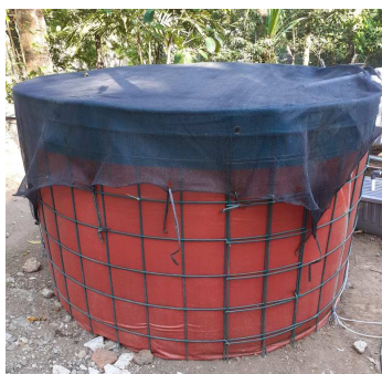
Figure 1. Biofloc Ponds

This research is a research development (R & D) . The development procedure uses the Borg and Gall model. Biofloc technology application is also carried out in this activity, namely making biofloc pools, preparing water media, growing floc, feeding management and water quality management.