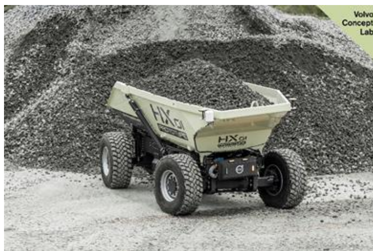
Figure 7. Volvo HX1 dump truck

Volvo HX unmanned dump trucks are the part of the Volvo Electric Site project of development electrified mining company with a minimal harmful emission. The first Volvo HX1 prototype (figure 7) was used to refine the concept of unmanned electric dump truck. Volvo chose the concept that uses a large number of small dump trucks instead of several with a large carrying capacity and which allows to reduce losses in the event of failure of one of the dump trucks [28]–[30].