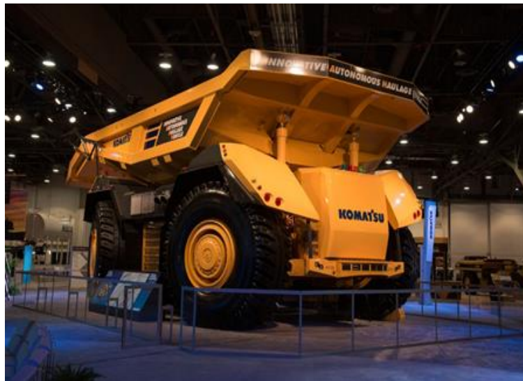
Figure 6. Komatsu IAHV dump truck

The main features of this model — are the ability to move forward and backward with a same speed, and steering of all four wheels. Thanks to these options the time for setting the dump truck for loading and unloading is reduced, as well as space in bottomhole and unloading zones is saved, since there is no need to turn the truck. Komatsu IAHV can move sideways. The center of mass is located in the middle part of the truck, what allowed to evenly distribute load on the wheels and to equalize grip coefficient to the road of all wheels. Today, the design is in a trial operation.