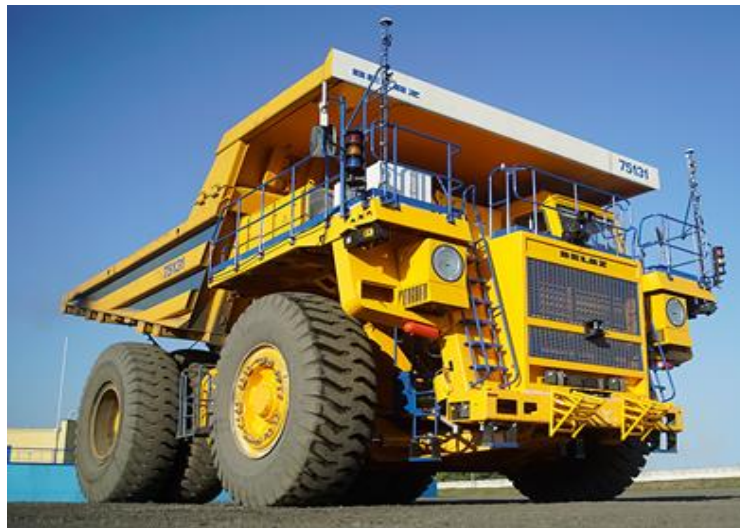
Figure 5. Autonomous mining dump truck BelAZ-7513R

BelAZ-7513R works as follows: the dispatcher issues a shift task to the system, allocates the required number of pieces of equipment and the production route. Trucks leave the parking lot for the site and begin continuous operation - loading, road, unloading. The operator can reassign the machine to another route or send it to the parking lot: the robot will finish the current cycle and head to a new task.