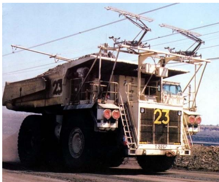
Figure 3. BelAZ-7524-3792

In the works [15]–[18] it was revealed that there is a tendency to deepen the career depth. Increasing depth leads to a deterioration in operating conditions. Gas contamination is increasing, especially in the lower part of the career. In the main works, the need to reduce harmful emissions from the operation of mining equipment is noted. In some works, it is proposed to use trolley cars that are powered by a contact network. The advantages of trolley cars over the classic diesel-electric circuit are examined in detail. Transfer to electric traction will reduce the level of harmful substances in the air, noise and vibration. The complete transition to the use of trolley cars is complicated by the lack of flexibility in moving the contact network. This approach requires the organization of fixed loading and unloading sites. To solve the problems of flexibility and mobility, it is proposed to use diesel trolley vehicles (see Figure 3).