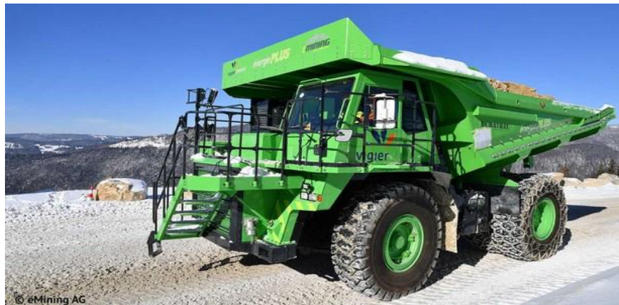
Figure 4. Electric dump truck eDumper

Like all electric vehicles, eDumper recuperates the energy generated by braking. While braking occurs, the electric motor goes into reverse mode, producing electricity that charges the batteries. The eDumper is used in a mine near Biel (Switzerland). It transports 65 tons of rock to a cement factory down the mountain with a slope of 13%. When descending from the mountain, the dump truck has a large inertia, due to which the regenerative braking system charges the batteries. As a result, eDumper charges itself and does not require frequent network connections. Battery charge measurements were taken after ascending with a fully loaded body and after descending to the loading point in the quarry. At the beginning of the rise, the battery charge was 90%, after the rise it was 80%. After the descent due to the recovery of power, the batteries were charged up to 88%, which is almost equal to the initial charge of the batteries. A dump truck carries out about 20 descents and ascents daily.