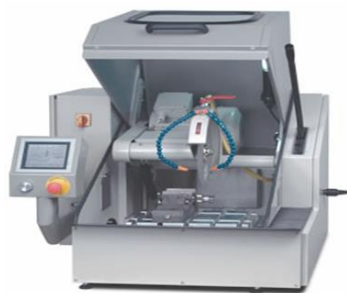
Figure 2. Cutting machine LECO MSX 250A.

The specimens will be prepared by cutting to the dimensions 12 \times 10 \times 9 \text{ mm} using Leco MSX 250A cutting machine shown on figure 2.