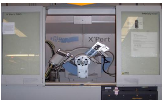
Figure 4. X-Ray Diffraction machine model PANalytical X'pert BRO.

The SEM uses a focused beam of high-energy electrons to generate a variety of signals at the surface of solid specimens. X-ray scattering technique is one of the non-destructive analytical techniques, which reveal information about the crystal structure, chemical composition, and physical properties of materials and thin films. These techniques are based on measuring the scattered intensity of an X-ray beam hitting a specimen as a function of the incident and scattered angle, polarization, and wavelength or energy.