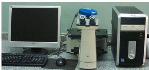
Figure 3. Light optical microscope (LECO LX 31) connect with camera (Pax cam) to image analysis software (Pax-it).

Light microscope, on figure 3, was employed to examine the microstructure, structure and substrate at magnifications between 50x to 500x.