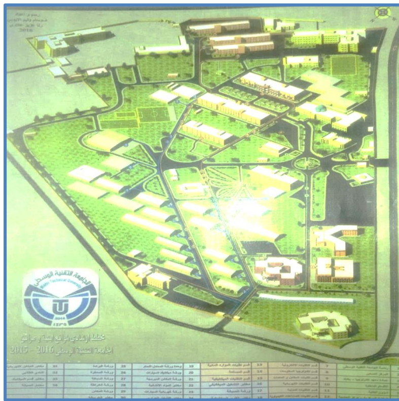
Figure 3. Map of Technology institute – Baghdad[23]