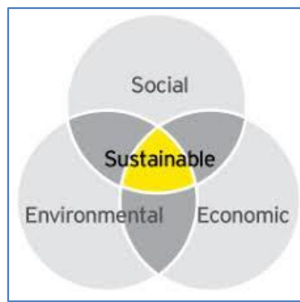
Figure 1. The triple bottom line (TBL) of sustainability [3].

The TBL aims to the integration among the three dimensions, taking into account that each of them is equally important.