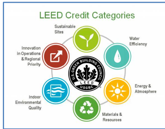
Figure 2. LEED Credit Categories [21]

There are mandatory credits for any level of LEED certification.