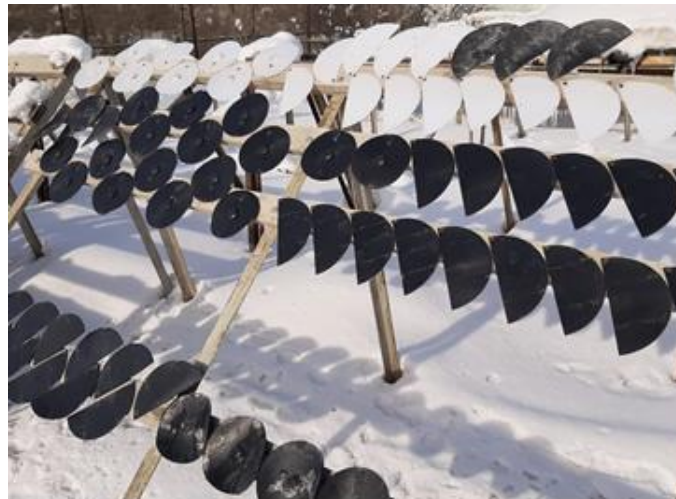
Figure 2. Exposed Samples.

The results of studies of the physical-mechanical properties of UHMWPE and a composite based on UHMWPE and CF subjected to full-scale exposure in the climatic conditions of Yakutsk are presented in Table. 1.