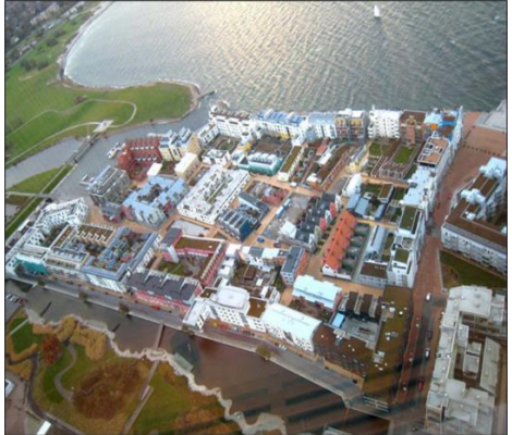
Figure 9. District (Bo01 in Malmo) (https://www.urbangreenbluegrids.com/)

The sustainable approach was an essential form of planning building instructions in the establishment of the area. Figure 9. [\underline{1}]