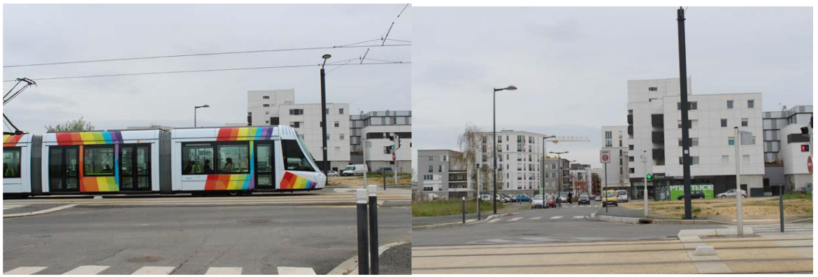
Figure 3. Les Hauts de Saint Aubin, Avril 2013