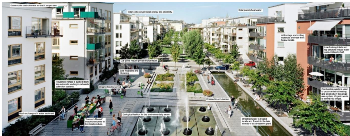
Figure 2. The type Les quartiers prototypes

2- The type "Les quartiers prototypes": which can be classified under the category of (technoquartiers) such as (BO 01) in (Malmo), and (Hammerby) neighborhood in (Stockholm), which are high-end and expensive neighborhoods designated for the affluent class of society, however, it is ideal in terms of the environmental plan, which makes it an excellent facade of the city. For example, Hammerby, which was an industrial enclave in the Swedish port city of Stockholm, attracted in 2005 more than (70,000) visitors Figure 2 [6].