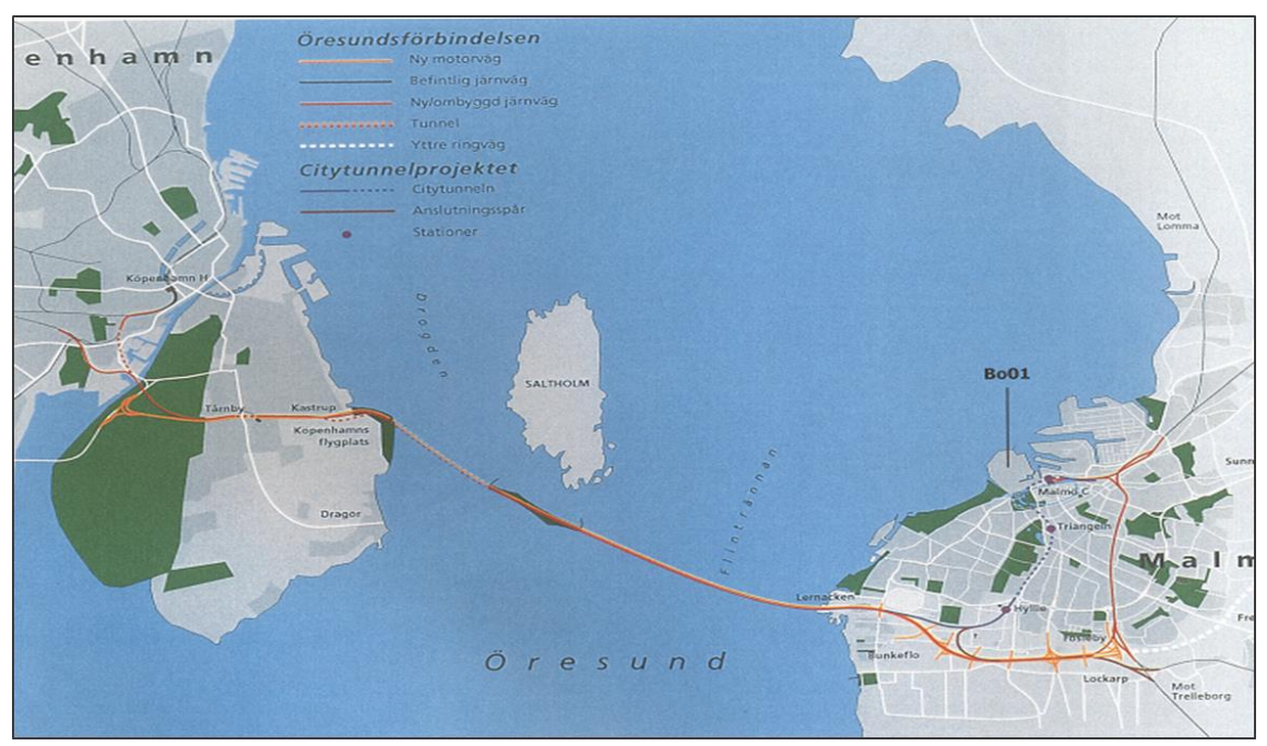
Figure 10. The bridge <a href="https://www.urbangreenbluegrids.com/">https://www.urbangreenbluegrids.com/</a>

As this neighborhood was established within the framework of the European Exhibition for the Sustainable City in (2001) and the works ended in it in (2005). As for preparing the neighborhood, its structure was based on three basic environmental objectives: Figure 11 and Figure 12