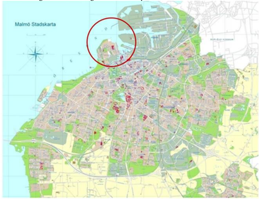
Figure 11. District (Bo01 in Malmo) (<a href="https://www.urbangreenbluegrids.com/">https://www.urbangreenbluegrids.com/</a>)