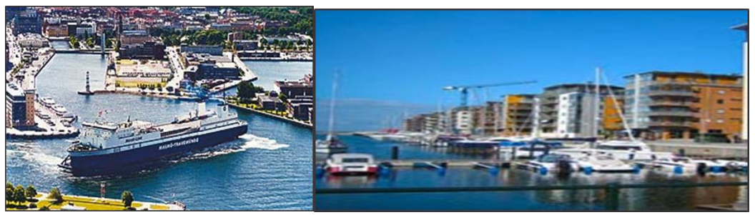
Figure 4. City economy <a href="https://laboureconomics.wordpress.com">https://laboureconomics.wordpress.com</a>

The industries that continue to increase are businesses in Malmö, financial and business services, entertainment, and construction.