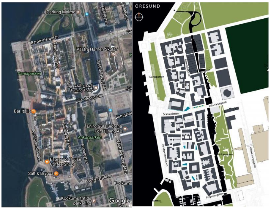
Figure 12. District (Bo01 in Malmo) (https://www.urbangreenbluegrids.com/)

Accordingly, the sustainable environmental neighborhoods differ in terms of purpose and construction conditions, but they share many advantages, which generally revolve around observing the environmental, social and economic conditions of the neighborhood and the city in general. [12]