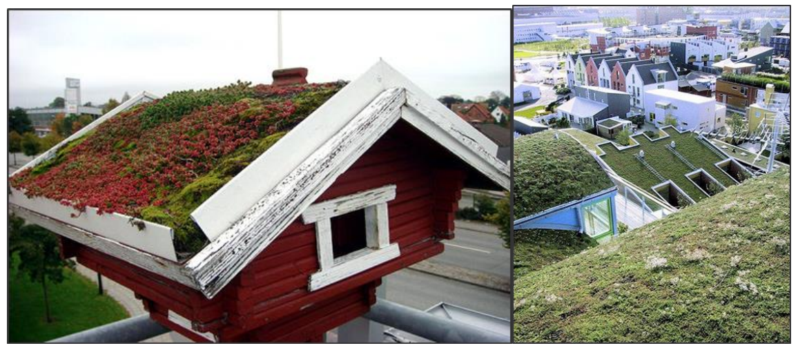
Figure 6. Green Roofs.

In the Augustenborg Eco district, about 1 km from the city center are roof gardens that are the largest in the world [21].