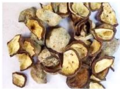
Figure 1. Candlenut shell [13].

This research method is done by means of the experiment. The raw material used in this research is candlenut shell waste (Figure 1). Candlenut shell waste was gathered from candlenut collectors in the South Aceh Regency. The initial process of preparation charcoal sample test was drying process. Candlenut shells were naturally dried using sunlight then proceed into candlenut shelling.