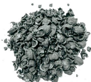
Figure 3. Candlenut shell Charcoal.

when the early combustion is carried out in the carbonization chamber I and is completed when the candlenut shell has all burned. The cooling process starts when the combustion process is stopped by closing all the air supply holes into the tool and is completed when the temperature of the outer wall of the carbonization tool is equal to the ambient temperature. The carbonization stages processes 8 kg in each carbonization chamber. Figure 3 shows the charcoal produced from candlenut shell carbonization processed by candlenut shell carbonization tool using vertical multi chamber (CCT-VMC).