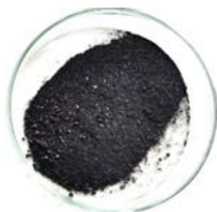
Figure 4. Candlenut shell Charcoal Powder

For ash content testing purpose, the sample used was prepared in the form of powder. Candlenut shell charcoal was weighed, crushed and milled into small particle sizes using compression method until to form a powder. In order to get a homogeneous (uniform) particle size, the candlenut shell charcoal was then sieved until the sample is ready to be tested (Figure 4).