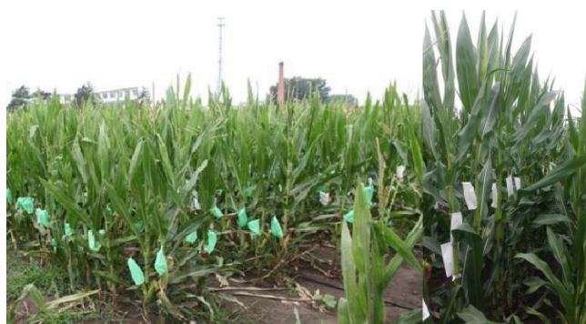
Figure 3. Plants of DH^0 and DH^1 after C3 selection. Left is haploid (or DH^0 ) plants, right is DH^1 lines.