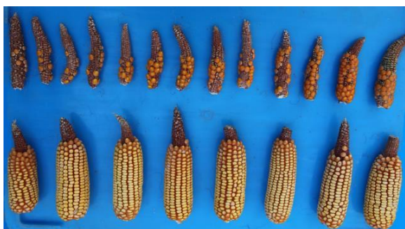
Figure 2. Selfed ears of DH0 and DH1 after C3 Selection Up is selfed ears from DH0, down is selfed ears from DH1.

Based on the evidence that maize doubled recurrent selection method is the foundation for modern commercial breeding, also the recurrent selection repairing ability to increase spontaneous doubling rate of the haploids, it is possible to combine both to construct a haploid double recurrent selection breeding system, based on spontaneous doubling rate increase. Also, it is possible to use recombined DH lines as source materials in recurrent selection to improve female population (stiff-stalk group) and male population (non-stiff stalk group). This n cycle DH recombination intra population improvement can be used to construct two set core germplasm groups. And at different breeding stages, based on trait improvement at different breeding stage, it is possible to introgress new useful genes to generate new DH lines. We also can use hybrid cross, and backcross method to integrate high spontaneous doubling rate from DH to core germplasm or major inbreds, to create high spontaneous rate DH lines in different heterotic group for practical breeding application. Selected ears and plants showed in figure 2-3.