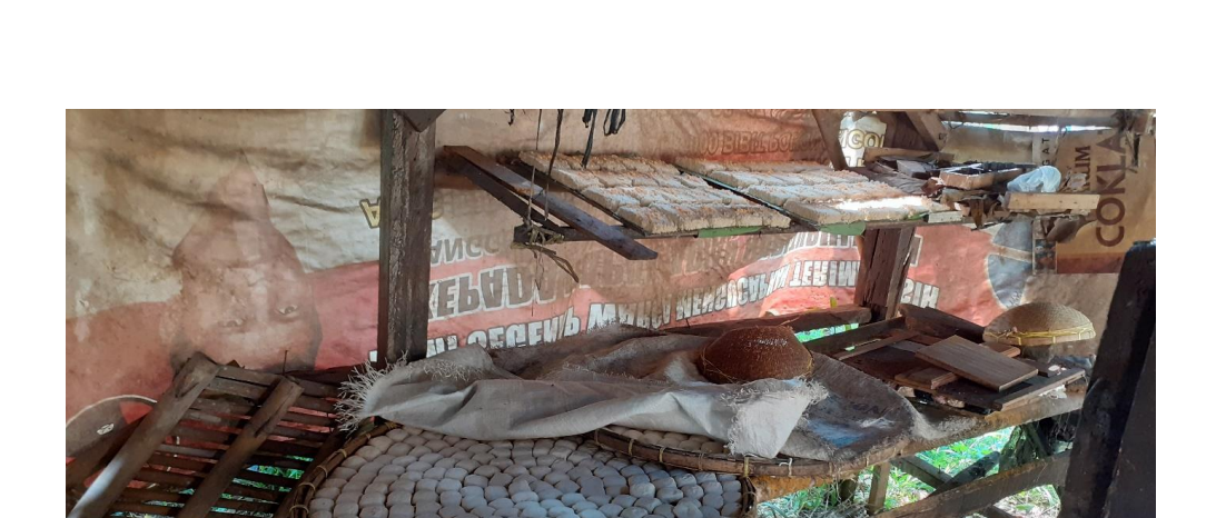
Figure 1. Finished good of tahu iwul

IOP Conf. Series: Earth and Environmental Science 485 (2020) 012065