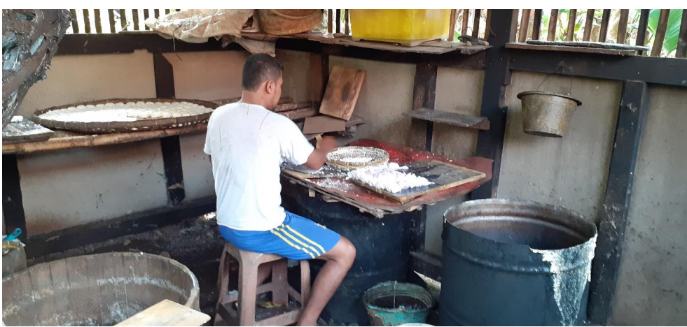
Figure 2. The production process of tahu iwul