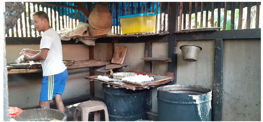
Figure 3. The production process of tahu iwul