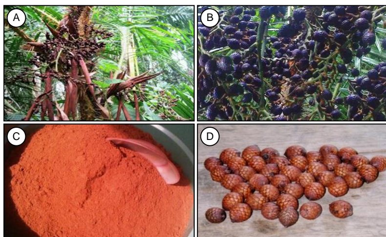
Figure 1. Performance of jernang ( Daemonorops sp.). (A) Tree of jernang. (B) Jernang fruits at the tree branches. (C) Harvested fruits. (D) Jernang powder or dragon blood as primary raw materials applied in pharmacy and industry (DIA Aceh 2018).

In general, its application has been widely known in the traditional ancient chinese medicines for centuries as haemostatic agent, antidiarrhetic, antiulcer, antimicrobial and as anti-inflammatory (Figure 1). Particularly the dracorhodin, a natural biocompound which belongs to the anthocyanin family and distinguished as the valuable pharmacological substance for its antitumour and wound healing activity [2,4]. Besides, it is also applied in artistic applications in most of European churches in the 16 th centuries as reverse glass paintings or so called Hinterglasmalerei ; varnishing, or as red lacquer polish in most of expensive art works of furniture, violin or ceramics. It has also been applied as natural dyeing for clothes by some indigenous tribes of Borneo for its vivid color [5,6].