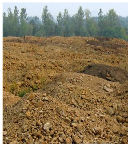
Figure 3. Interdeck of soil.

The technological production line was projected as a semi-mobile production line in order to process sludge with long unbranched chains (Figure 4). The chains form fibres at 25 \% of the dry solids, using suitable loose materials EBP soils with a continual dosage of solid, loose and liquid fractions and intensifiers (e.g. bio-algins), with the possibility of specifying the density of entry raw materials on strain-gauge (tensometric) scales. The first degree of processing runs on a safe surface with double independent packing. The second degree consists of a separator. It is a hopper of 3 \text{ m}^3 capacity and two contra-rotating cylinders with separator profiles powered by hydro motors. The separator is equipped with a vibrating machine and nozzles with industrial water for wetting the materials. Next, there are conveyor belts for the transport of material between individual processing degrees. The third degree is a homogeniser for industrial wastes, type EHN1200, of an oval shape, placed in a vertical position selected to continual homogenization of processed material. The material is adjusted in a separator first. It is possible to change the slant in the range of 80^\circ on the vertical axis in order to change the speed of passage of the material. The conveyor feeder belt transports the material to lorries, and/or to the material maturing lots (Figure 5).