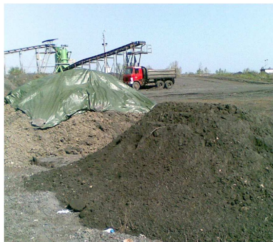
Figure 5. Maturing site for artificial soil substrate.