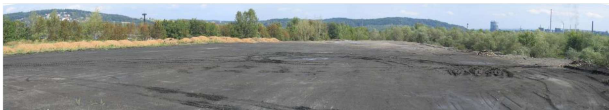
Figure 6. Natural conditions specific to the given area.

Chemical properties: analyses while observing the ranges as per Decree No. 294/2005 Coll. are in Annex 12 – the contents of noxious substances in a solid matrix, the ecotoxicity and the chemical elements in the aqueous liquor. Here it is necessary to remark that the total contents of elements in the solid phase of these artificial soils established by a complete chemical analysis indicate the potential pollution inaccurately. Geochemists and physical chemists knowledge of mobility and redistribution of trace elements and of their fixation to a solid phase, toxicologists and physiologists on the differing toxic effects of these elements on living organisms, lead to the necessity of analytical discerning, e.g. speciation of various forms of incident and of ways of fixation in the solid phase created by physical or chemical fixations.