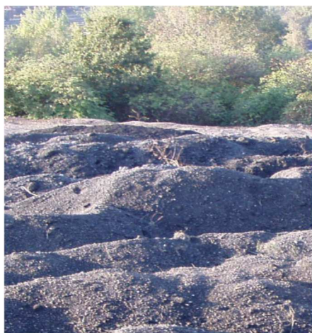
Figure 2. Interdeck of EBP.

Sources of selected excavation of soil (hereinafter referred to as soil) are mainly line and areal constructions that show homogenous properties. Due to the uneconomical soil use, the constructions are mostly former agriculture lands instead of unused industrial areas (Figure 3). The soils consist predominantly of clays, sands, grit, and stones that need to be sorted according to qualitative properties so as to be usable for further processing. They are in our case, vast reserves of clay soils formed mainly from clay material (mixed strata clay materials grading fraction under 2\mu\text{m} ). The clay material comprises more than 65 \% and further mica admixtures and silica ash. We use the term soil from an engineering-geological rock qualification because there are essential mechanical properties of rocks. Their load-bearing ratio CBR, apparent density, and permeability are important too. The permeability ranges from 10^{-9} to 10^{-7} \text{ m.s}^{-1} , etc. The chemical aspect of indicators is monitored in the range of the regulation 294/2005 Coll. App. 10.