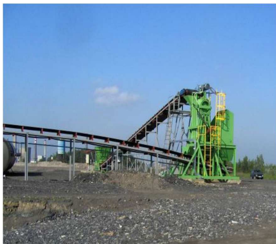
Figure 4. Technological production line.