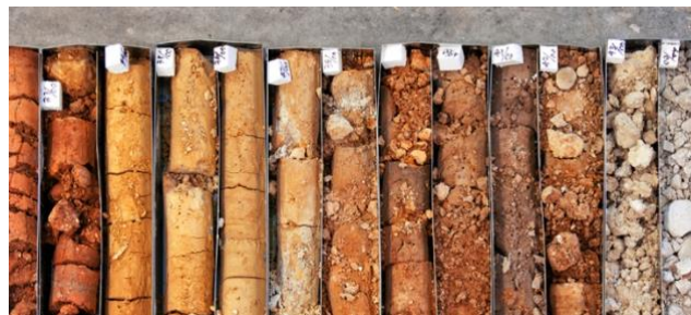
Figure 3: Homogenized soil classification, assessed in accordance with Australian Standard [64]

The challenge of material variation could be addressed by various strategies. By using wood as an example for a natural building material with large variability, we can identify the ways in which we developed both prescriptive and performance standards for timber. While the number of wood species is great, the main strategy used in timber standardization is to group species according to their structural properties and appearances, prescribing uniform grade-use data for each group. Similar to timber codes and standards, a homogenization approach grouping different species or ‘classes’ of clay materials should be developed for earthen materials to ensure adherence with format and objectives of conventional standards.