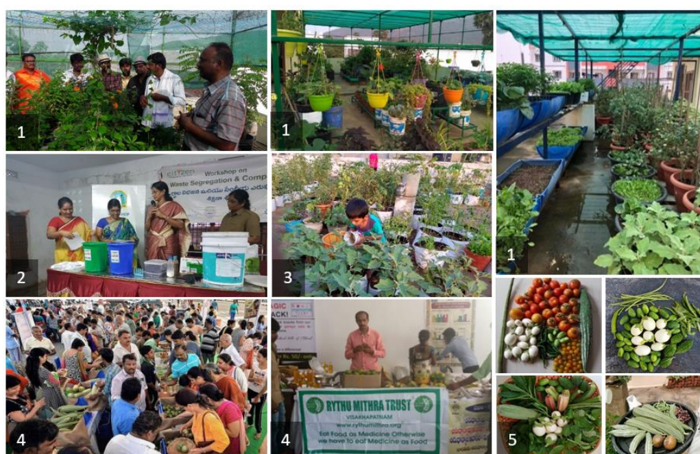
Figure 5: Photographs of the farms and events from the current Urban Farming activities in Visakhapatnam. (1) Roof top farm demos (2) Workshop conducted by an NGO on Waste segregation and composting (3) Child watering his rooftop farm (4) Organic/Natural Food farmer's Market (5) Pictures of the urban farm produce shared by the city farmers in their social network.

organization (NGO) named Rythumitra Foundation, is an active part of this group that aims at educating the city dwellers on how to do farming in their premises in a sustainable way using zero budget natural farming techniques. This NGO developed a model roof top kitchen garden, a farm on vacant plot and a food park in a semi urban area which they use to conduct workshops and awareness sessions on a weekly basis reaching out to more and more citizens. The organization also educates city dwellers about nutrition, healthy eating and treating diseases through herbal plants with a motto 'Eat food as medicine, otherwise you have to eat medicine as food'. They engage with schools and colleges to educate students on farming and healthy eating and encourage institutions to develop urban farms in their premises. Another NGO, Citizen encourage and guide the city dwellers in developing their own farms and also train them in activities like composting on a household level and community level. These spaces help in creating a dialogue, encourage community engagement and empowerment as well as introduce city-dwellers to fresh, safe, healthy home grown produce.