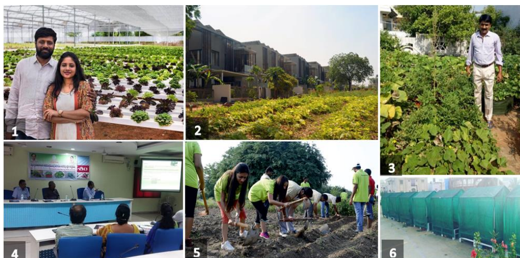
Figure 4: Urban Agriculture activities in Hyderabad [6]. (1) Couple in Hyderabad use the hydroponic technique to grow exotic salads leaves, vegetables and flowers (2) Co-housing facility and Community farming in Organo. (3) A resident posing with his rooftop farm which he started with the kit that the horticulture department sold at a subsidized amount. (4) Awareness and training program to city dwellers (5) professionals by the weekday and community farmers by the weekend (6) Homecrop's modular vegetable gardens on rooftops [7].