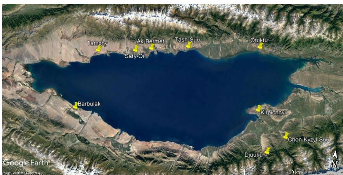
Figure 3. Map of geothermal sources location in Issyk-Kul oblast

A large number of geothermal sources are located in Issyk-Kul region (Figure 3). In the coastal zone of Issyk-Kul Lake, geothermal deposits are used for medical purposes. Other sources, such as Juukuchak, Bozuchuk and Chon-Kyzyl-Suu, located on the northern slope of Terskey-Ala-Too are only slightly used by the local population, and most are almost not used. On the northern and southern coast of Issyk-Kul Lake, there are 24 wells with a depth of 800 to 1960 m, 21 of them are mineral waters with valuable balneological properties [18]. The temperature of these sources varies from 36 to 50 °C with a mineralization of 2.7-40 g/l and with wells productivity of 2.5-6 l/sec. The exploitation reserves of deposits on the southern slope of the Terskey Ala-Too mountain range - Arabel and on the northern slope - Ulahol and Turasu, are 62 thousand m 3 per day [11].