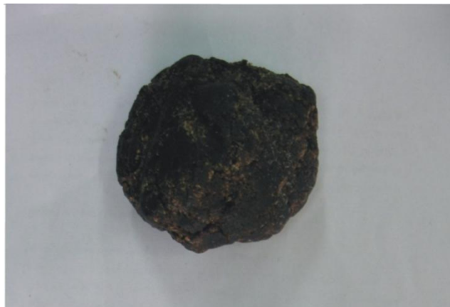
Figure 12: Herbal soap (Sample G) Cocoa pod ash/lye + fried palm kernel oil (filler added) found in Igboora, Oyo State, Derived Savannah Area