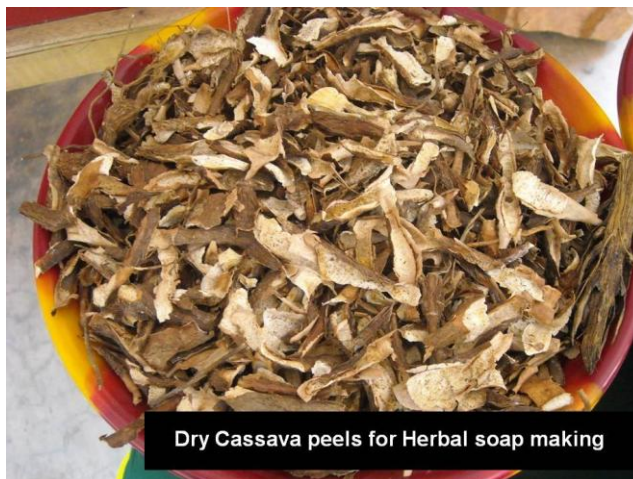
Figure 3: Waste-to-wealth initiative (Utilization of Agricultural -wastes such as cassava peels in herbal soap making)