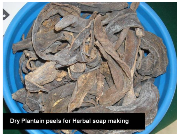
Figure 5: Waste-to-wealth initiative (Utilization of Agricultural - wastes such as Plantain peels in herbal soap making)