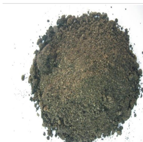
Figure 7: Herbal soap (Sample B) Cocoa pod ash/lye + fried palm kernel oil (filler added) found in Igboora, Oyo State, Derived Savannah Area.