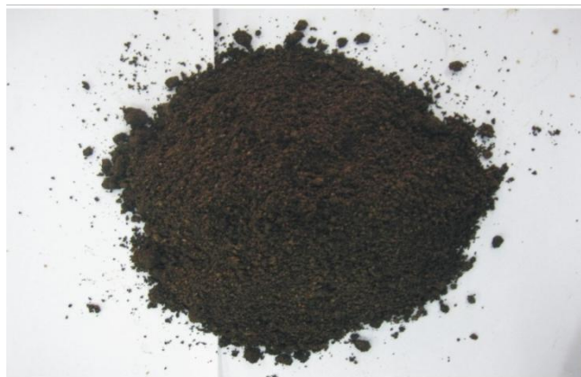
Figure 9: Herbal soap (Sample D) Cocoa pod ash/lye + fried palm kernel oil (filler added) found in Iseyin, Oyo State, Derived Savannah Area