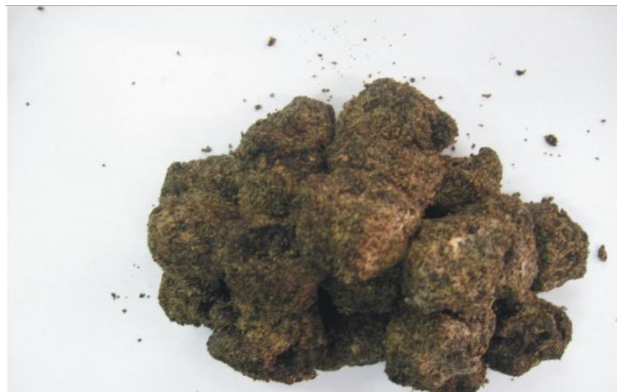
Figure 8: Herbal soap (Sample C) Wood ash/lye + fried palm kernel oil (filler added) found in Ipako, Oyo State, Savannah Area.