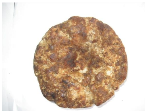
Figure 15: Herbal soap (Sample J) Cocoa pod and plantain ashes/lye + fried palm kernel oil (filler added) found in Agege market, Lagos State, (Control Specimen imported from Ghana)

The conductivity ( \mu\text{S}/\text{cm} ) of the herbal soaps range from 18,200- 47,150 ( \mu\text{S}/\text{cm} ). This measured parameter indicated the extents of dissolved ions present in the herbal soap materials that when released nourishes the skin on use. The higher the dissolved ions, the better for skin absorption of the desirable ions from herbal soap and this result into healthy and beautiful skin. The results of chemical attributes confirm the age long attributes associated with herbal/black soap which is in line with findings of Yusuf and Adeogun [1, 2].