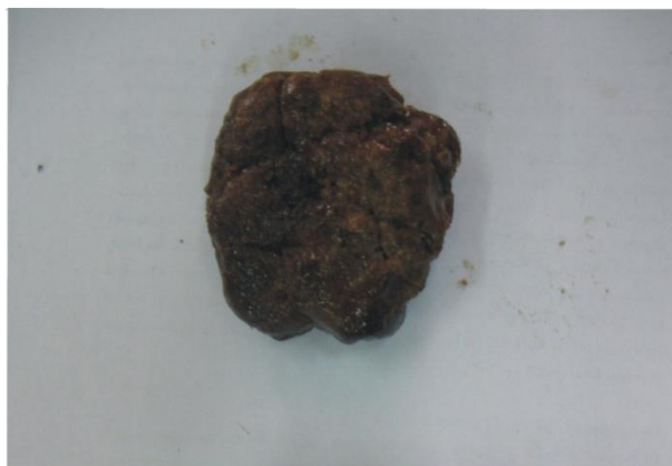
Figure 13: Herbal soap (Sample H) Cocoa pod ash/lye + white palm kernel oil (filler added) found in Akinyele, Oyo State, Forest Area