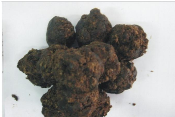
Figure 11: Herbal soap (Sample F) Cocoa pod ash/lye + fried palm kernel oil (no filler added) found in Aawe, Oyo State, Derived Savannah Area