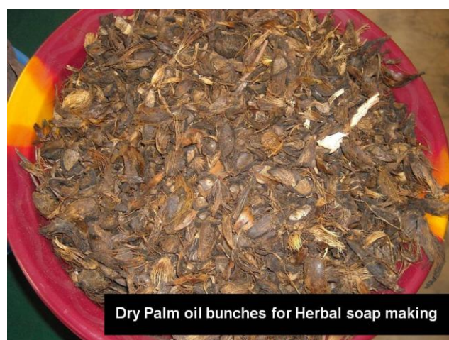
Figure 4: Waste-to-wealth initiative (Utilization of Agricultural - wastes such as Palm-oil bunches in herbal soap making)