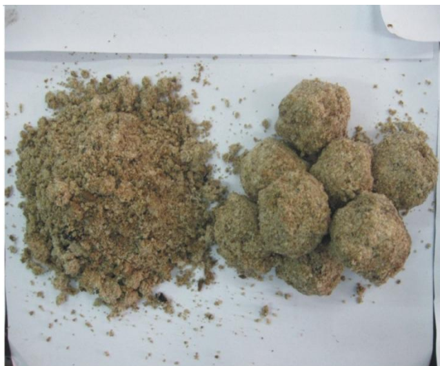
Figure 10: Herbal soap (Sample E) Cocopod ash/lye + white palm kernel oil (no filler added) found in Aawe, Oyo State, Derived Savannah Area.