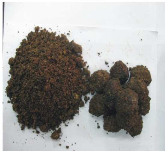
Figure 6: Herbal soap (Sample A) Cocoa pod ash/lye + fried palm kernel oil (no filler added) found in Osiele, Ogun State, Nigeria, Forest Area.