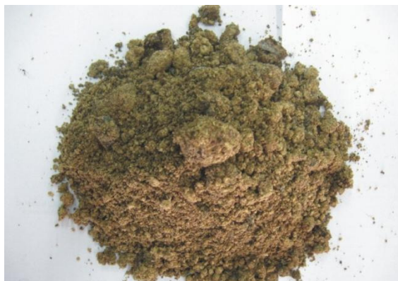
Figure 14: Herbal soap (Sample I) Wood ash/lye + roasted palm kernel oil (no filler added)