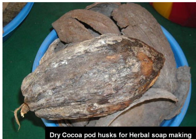
Figure 2: Waste-to-wealth initiative (Utilization of Agricultural-wastes such as Cocoa pod husks in herbal soap making)