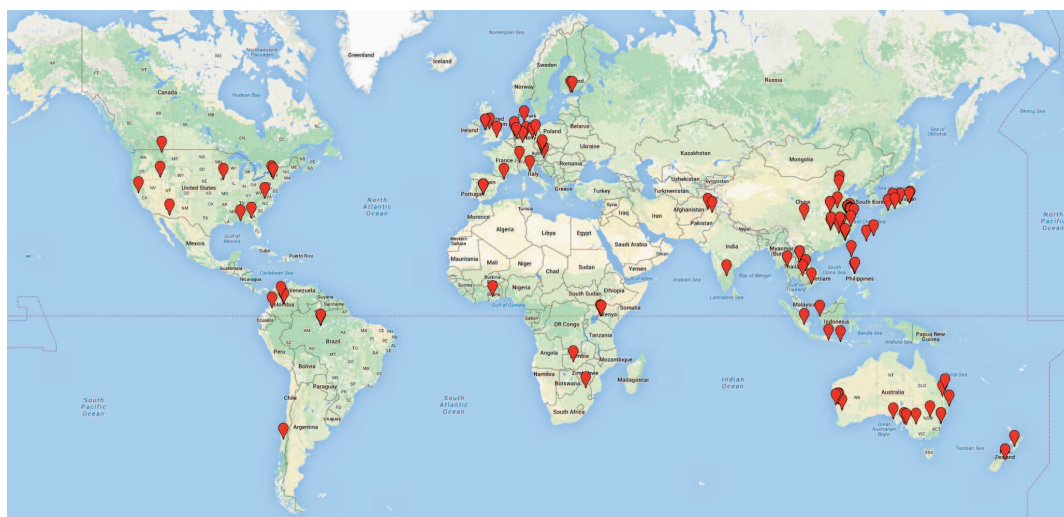
Figure 2. Map showing the global distribution of the 107 experimental sites included in the meta-analysis database for which data location data were available. Note that each marker may represent several studies published by the same research institute.

biochar application rate of 15 \text{ t ha}^{-1} (online supplementary figure 12). These results show that the effects of biochar on yield cannot be extrapolated from tropical to temperate regions [20]. The reason for the differences in application rates between temperate and tropical systems is unclear. However, it is likely impacted by the fact that potential feedstock materials are more restricted in the tropics, where the produced biomass is generally used for other purposes [20]. That yield increases were seen in tropical soils despite the lower biochar application rate used for temperate soils provides evidence for the hypothesis that yield benefits derive from a nutrient effect. If the nutrients that can be provided by the biochar are already not limiting to crop growth, as is more likely the case in the relatively fertile temperate soils compared to tropical soils, then adding more nutrients is unlikely to have any impact [21].