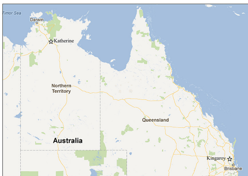
Figure 1. A map of northern Australia showing Kingaroy in south-east Queensland and Katherine in the Northern Territory (map developed from Google Earth).