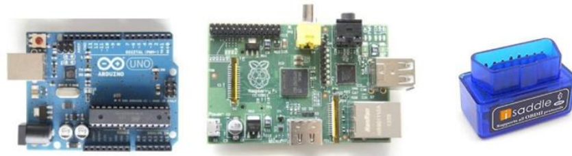
Figure 1. From left to right: An Arduino Uno [4], a Raspberry Pi [4], iSaddle Bluetooth OBD-II Scanner[5]

The Raspberry Pi is an inexpensive credit-card sized computer, that has 700Mhz processor, 512MB of SDRAM, on board Ethernet, HDMI and RCA interfaces, a dual USB connector and an SD card slot. In addition it maintains an array of input/output pins that make the Raspberry Pi extraordinarily conducive to tinkering and device innovation [6].