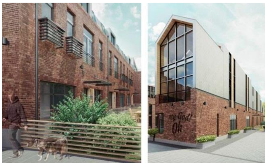
Figure 3. Housing estate. Project. Moscow. Russia.

Therefore it isn't surprising that in New York, along Hudson River where earlier loaders and sailors scurried about, people play golf now. Thousands of people visit the power plant building in London, the Museum of Modern Art was located there. In Omaha, the former rooms for the cattle, are filled with rock music sounds, sound recording studios have located there. In Russia, Moscow, hundreds of young people want to arrive or just to plunge into the creative atmosphere of «Red October» Chocolate factory, the institute of media, architecture and design of «STRELKA» exactly there has opened the doors. In places where pipes of the enterprises smoked and there were warehouses, now it is possible to have a rest in a shadow of trees, to visit a new exhibition, to get housing or to have office rooms. absolutely another life boils there now.