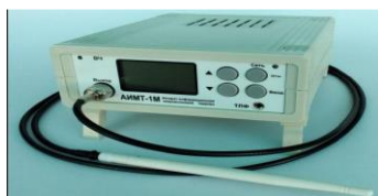
Figure 2. Device for simulating solar microwave radiation (AIMT-1) in the frequency range (4.0–4.3) GHz.

One of these technologies is associated with the medical use of a device for simulating the solar microwave radiation reaching the Earth's surface [9]. Its application makes it possible to restore in the body in conditions of electromagnetic pollution of the environment the natural mechanisms of regulation, which underlie the evolution of living nature. The developed device (figure 2), protected by the RF patent under the name: "Device for reducing the resistant properties of microorganisms" [10], implements the known knowledge about the structure of low-frequency variations, the parameters of amplitude pulsations and the type of polarization of the solar microwave radiation in the frequency range 4.0–4.3 GHz with a maximum intensity not exceeding 100 \mu\text{W} / \text{cm}^2 . This device makes it possible to simulate bursts of solar microwave radiation in the range of values from several seconds to tens of minutes, both with linear and chaotic polarization. The amplitude spectrum of such radiation can vary in width, shape, and intensity.