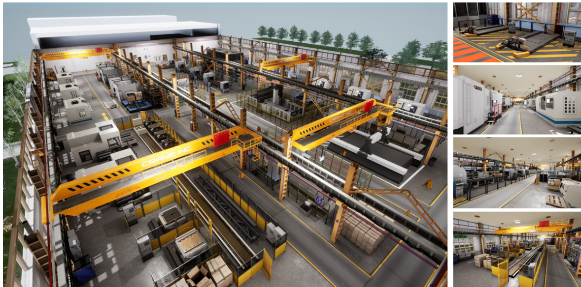
Fig.2 Digital twin high-fidelity model of a company's actual production workshop

In the scheduling planning process, the product, process, and bill of materials are first taken as input conditions of the production line and brought to the platform. The platform passes the input conditions to the scheduling algorithm in the solving thread, and the scheduling algorithm starts to calculate. When the result set is generated and fed back to the digital twin environment in the platform, the manager can observe the scheduling results in the digital twin environment and determine the final plan. At the same time, any disturbance on the production line will be passed to the data monitoring. In the case of monitoring the disturbance, the digital twin environment will pass the disturbance to the solving thread, and the solving thread will recalculate the scheduling and solve the new scheduling result. The manager re-observes the results and issues new instructions. Figure 3 is the production scheduling interface, in which the Gantt chart, time axis, and time multiplier functions are provided. Click on the device to query the device status at the current time and production resource information.