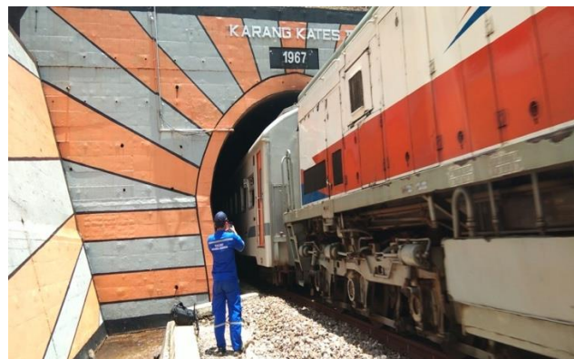
Figure 2.1 Wind speed data retrieval

Based on table 2.1, the average speed of the train movement is 6 m / s. From the wind speed data, it can be a reference for performing calculations to determine the diameter of the savonius wind turbine. The way to find out the diameter size of the angina savonius turbine is by using the formula :