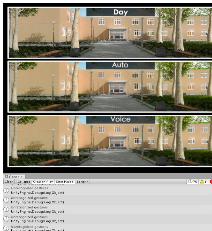
Fig.1 Menu control of gesture recognition

Above for instance operation, in the case of open palm, the mapping action is returned to the superior menu.