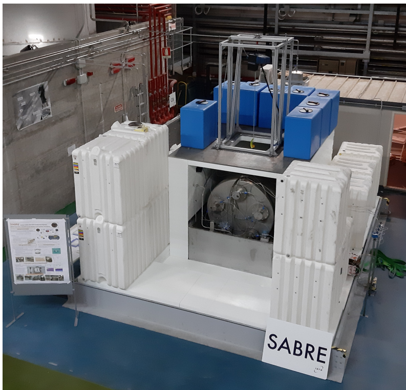
Figure 2. The SABRE Proof of Principle setup in hall C of LNGS. A side of the cylindrical veto vessel with five PMT housings is visible in the centre of the polyethylene shield, which is surrounded by water tanks. The removable structure mounted on top of the shielding is the crystal insertion system.

is currently limited by the presence of cosmogenic isotopes so we first focused on alpha decays that can be easily identified by the charge-weighted mean-time. Alpha activity turned out to be (0.48 \pm 0.01) mBq/kg but we also found indications that most of this rate is due to ^{210}\text{Po} decays from a ^{210}\text{Pb} contamination out of equilibrium. The current analysis activity is focused on the development of noise rejection algorithms and on energy threshold reduction with the intent to better understand the low energy region of the spectrum and to produce a first background model capable to assess crystal contaminations.