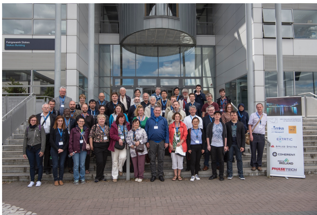
24 th International Conference on Spectral Line Shapes, Dublin, June 2018.

It is commonly accepted that the Europhysics Study Conference on Spectral Line Broadening and Related Topics which was held in Meudon in 1973 was the first in the current series of ICSLS meetings. The ICSLS is a bi-annual conference series and to date has been held at alternating European and North-American conference venues. It is proposed that it move to other continents in future. The most recent venues were Paris, France (2004), Auburn, USA (2006), Valladolid, Spain (2008), St. John's, Canada (2010), St. Petersburg, Russia (2012), Tullahoma, Tennessee, USA (2014) and Torun, Poland (2016). The 2018 (24th) ICSLS conference took place in Dublin during June 17 - 22, 2018.