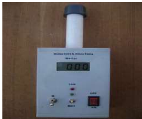
Figure (3): Photograph of milligauss-meter used in the present work[22].