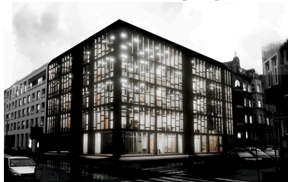
Figure 3. Loudspeakers Manufacture [17]

Another important approach towards the design of creative industry plants aims to provide a convenient space for the technology to be contained within the building and to subsequently wrap it with the fabrics of an individualised facade. In its turn, the facade tells the story of what is happening inside by means of its structure, materials selection and detailing. Innovative facade design animates the street frontage and so contributes to the urban landscape improvement. [9]