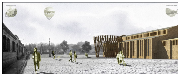
Figure 4. Recycled Furniture Workshop [18]

The notion of contextual adjustment of a new building finds its wide application in city centres as well as in its historical neighbourhoods. The respect for the adjacent historical architecture, which is sometimes of an outstanding quality, does not have to represent a constraint to the designer. On the contrary, it often brings inspiration and defines first design guidelines. This process can be exemplified by a project of the recycled furniture workshop, the author of which found inspiration both in the urban morphology of the selected location as well as in the typically used materials and detailing. The project is located in an old slaughterhouse complex and its building type is a contemporary reinterpretation of the typical, historically grounded form of the industrial nave (figure 4). Selected materials, which are recycled brick, corroded metal sheets and aged wood, refer both to the recycling as a concept and as an integral part of a lifestyle, diffusing its philosophic principles, as well as to the recently established character of the location, which has been transformed into a flea market and furniture renovation base.