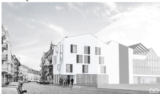
Figure 7. Eyewear Manufacture [21]

Useful in terms of identifying the guidelines for an integrated architectural intervention into the existing urban form, urban analysis precedes conceptualisation of the building's volume and form in numerous other designs for creative industry plants. For example, such a study made for a narrow and elongated plot closing a city block in Poznań has proven the significance of the locally settled architectural type of dwellings as well as its characteristic features, such as standard roof pitch, scale and proportions of facades forming the street frontage (figure 7). The spatial guidelines obtained as a result of the urban analysis led to the division of the proposed building's front elevation into three parts, the proportions of which comply with the characteristics of locally grounded front-gable dwelling type. The adapted spatial typology and the consequent vertical divisions result in a jagged roofline of the building that is designed to host an eyewear manufacturing company. At the same time, the innovative character of the enterprise is reflected by the use of modern materials and technology solutions. Moreover, the design approach does also include the results of the view analysis, which have influenced both the location and the shape of openings, creating a series interiors distinguished by the panoramic views of the city.