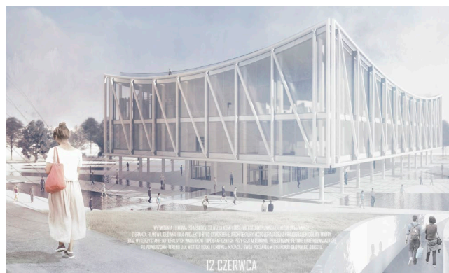
Figure 1. Film Studio [15]

Giving in the effect sculptural forms, the method is associated with an extremely powerful intervention into the city's fabric. The projects that result from the application of this method tend to dominate over the existing urban landscape and most often become its new important landmarks, organising the surrounding urban space [14]. For some certainly controversial as they cause a powerful change to the established landscape, they represent, however, a significant trend in creative industry architecture design.