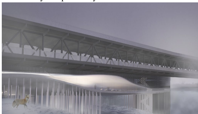
Figure 8. Creative House [22]

transformed into unique public spaces. An example of such an intervention is the project of the Creative House (figure 8) situated under the Gdański Bridge in Warsaw. For structural reasons, the designed building was not actually suspended under the bridge, its architectural form, however, was significantly influenced by such a concept. The inspiration resulted in a decision to apply a support system consisting of many columns characterised by a small cross section instead of one pair of massive pillars. Spanned between the two groups of poles, the elongated building's volume is defined by its two predominant features: the wavy form of slabs, which imitates the effect of the rippling river, and a dense lattice structure, modelled after one of Warsaw's pre-war bridges and used on the building's elevations. In the case of the discussed project, conclusions drawn by the student from accomplished analysis of the existing context do not only enrich the architectural design in local references, influencing its aesthetic quality, but they do also connect it with the quest for new public spaces that could effectively and plastically blend into the established urban form.