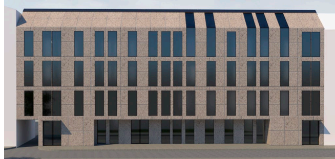
Figure 5. Fashion House [19]

characterized by a contemporary style, modern materials solutions as well as minimalist architectural detail (figure 5).