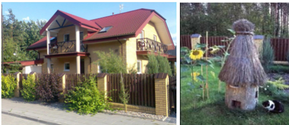
Figure 1. View of the front façade (NW direction) of the low-energy building LE1 (the LE2 building in addition to the color details is identical) - and the air intake to the ground heat exchanger

LE houses are equipped with mechanical ventilation system with heat recovery. The external air is supplied to the recuperator via a ground heat exchanger in which the ventilation air entering the interior of heated zone is preheated. In the summer season, after exchanging the contribution in the recuperator to the "summer" ground heat exchanger is used to cool the air blown into the building. The effect is obviously far from the standard air conditioning, but it allows to obtain a reduced internal temperature during the 24 hours during the highest outdoor temperatures.