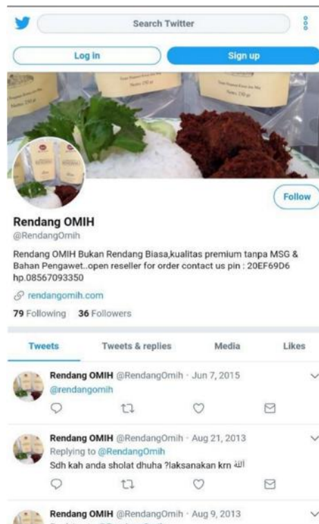
Figure 4. Twitter of Rendang Omih