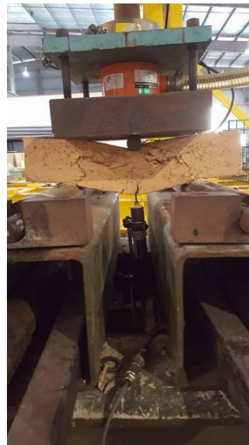
Figure 1. Compressive strength test setup. Figure 2. Flexural strength test setup.