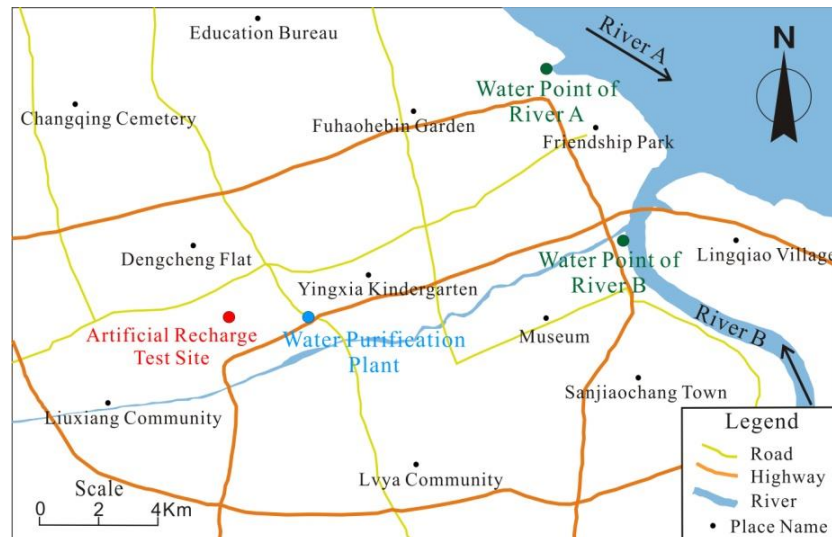
Figure 1. Location of the study area.

River A and River B to water treatment plant are separately 14.4 km and 13.8 km, water treatment plant is 2.4 km away from recharge test site. Test results of water of River A and B show that components of concentration in excess are total iron, manganese and TOC. According to the most stringent specifications, if the two alternative water will be recharged, water of River A and B must be transferred to water purification plant, the quality of the water is up to the standard (GB/T14848-2007), the recharge water was selected with the lowest cost, according to the cost of water taken and treatment, and then be recharged to the target aquifer.