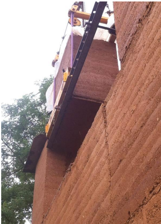
Figure 1. Implementation of prefabricated unstabilised rammed earth walls.

There are different techniques used to build with earth; however clay is always the main binder whatever the technique. We can distinguish “dry” manufacture process where the earth is compacted, and “wet” manufacture process where the earth is moulded or extruded or stacked [4]. We can also distinguish techniques using small blocks (compressed earth blocks or adobes) implemented with a mortar to build masonry structures, and earth implemented in monolithic walls. In that case we can have rammed earth (Figures 1 and 2) which is a clayey soil (usually less than 20% of clay by dry weight of soil) compacted into formworks with a water content varying with soils, but within the range of 8-20% by dry weight of soil (“dry” process). We also have cob which usually needs soil with a higher content of clay and higher water content of the mixture than rammed earth (“wet” process). Cob sometimes may also contain some kind of fibrous organic material (typically straw) and sometimes lime.