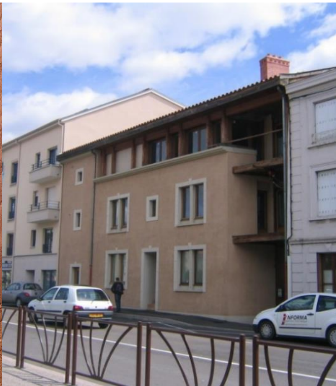
Figure 2. A completed building of 9.4 metres height with external render and traditional appearance built in 2011. © Nicolas Meunier.