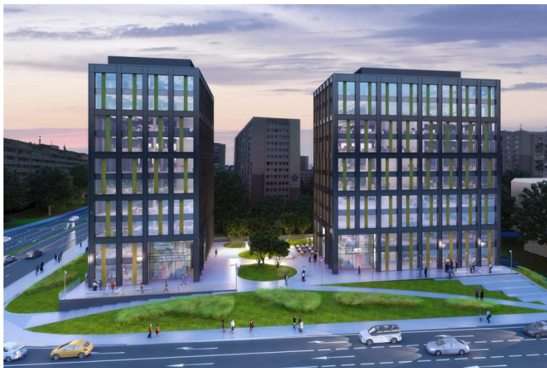
Figure 2. Duett Business Residence visualization.

twelve floors. Underground floors are used for parking and a business unit; the aboveground floors are used for renting office space. Aboveground floors consist of two separate towers of the Duett I tower and the Duett II tower. The underground floors are constructively designed as a white bath as an object formed by two dilation units located on a common undiluted base plate. The roofs of the two height parts of the tower Duett I and Duett II are designed as flat, partly sloping roofs.