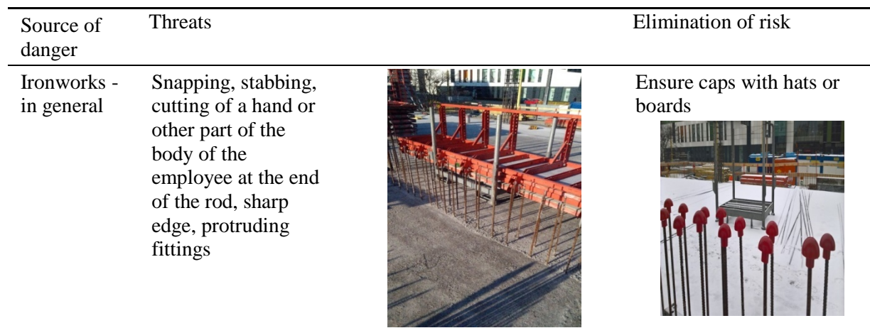
Table 5. Measures to eliminate the risks of the Duett construction.

reducing the safety risks at the construction site. A slight safety risk means that the system is safe with the trained operator, tours, and so on. Audit results, results of own evaluation, or form of feedback can also be used as risk elimination measures. Based on the risk assessment, measures to eliminate the risks of the Duett construction were established (example can be seen from Table 5). In this way, a proposal was made to eliminate the risks of the Duett construction, which should prevent occurrence of hazards of the critical objects located on the site or its immediate vicinity.