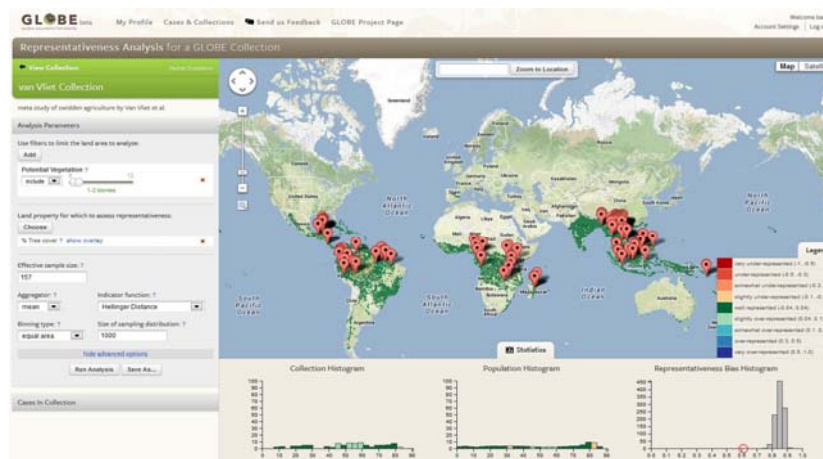
Figure 3: Representativeness analysis of the van Vliet collection based on global percent tree cover limited to the spatial extent of tropical biomes.