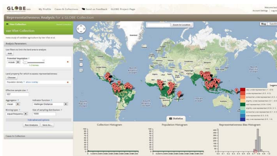
Figure 4: Representativeness analysis of the van Vliet collection based on global population density limited to the spatial extent of tropical biomes.

meta-study findings. The representativeness analyses in GLOBE are still being developed, and are currently limited to a single variable. Future versions will include functionality for multivariate representativeness analysis. Additional future capabilities will provide users with tools to improve the representativeness of existing collections. This can be done by either calculating a set of weights to compensate for over- and under-represented case studies, and/or searching for case studies specifically within underrepresented areas to add to a collection. More broadly, GLOBE will enable researchers and institutions to rapidly share, compare, and synthesize local and regional studies within the global context, as well as contributing to the larger goal of creating a Digital Earth.