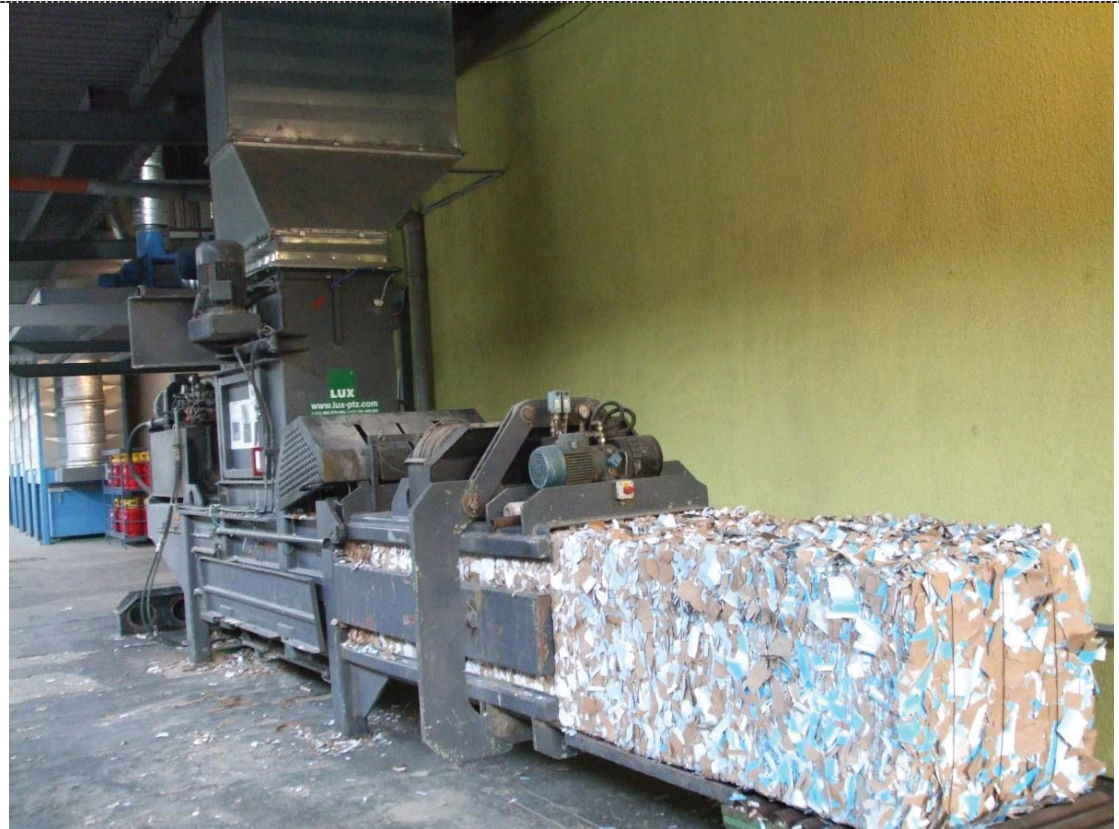
Figure 3. Pelleting.

The container as a part of the water cleaner comprises 1000 liters of dirty water. The flotation tank is the place for the direct process of the water treatment. The water recycling is necessary part of every production where the water contamination is part of the manufacturing process as legislation in European Union does not allow discharging water directly into the public sewer network when there is occurrence of the specific contamination.