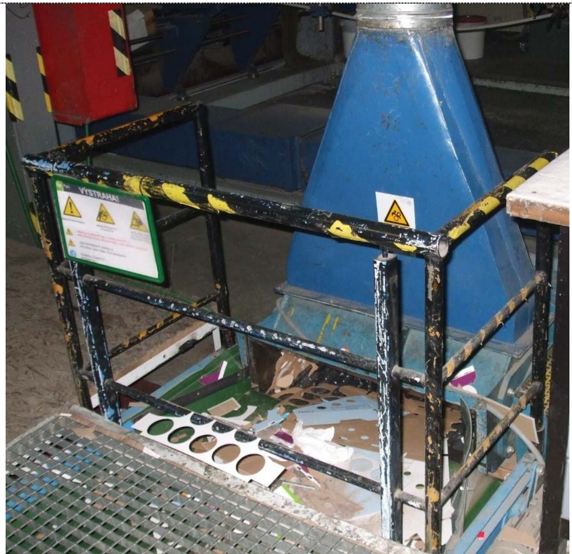
Figure 2. Shredding machine.

Suggested way for the water recycling is for instance the flotation technology. The example of the water cleaner working on the base of electro-flotation process is expressed in Figure 4. The water cleaner with the control system that is placed in the control box was designed in collaboration with a researcher and constructor Peter Antony from APmikro company. The concentrated dust is collected as foam from the surface of contaminated water during its recycling.