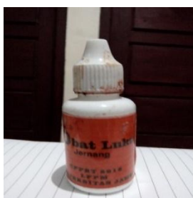
Figure 2. liquid wound medication from jernang ethanol extract