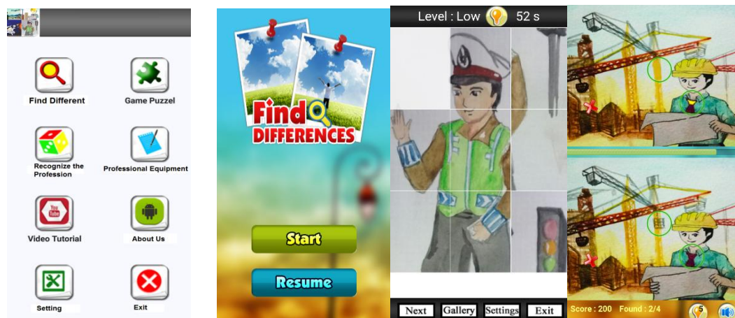
Figure 3. Main menu view and My Profession Edu Games

validation results as stated earlier. This menu consists of 1) pointing the image (from the sound of the image to the object), 2) the menu matching the profession with the equipment (the image is chosen by profession type), 3) the menu distinguish the professional image (find different), 4) menu in playing puzzle, and 5) a menu of concepts that explain the understanding of each profession (recognition) through the concept of sound. Some menu of pictures are shown in the following image: