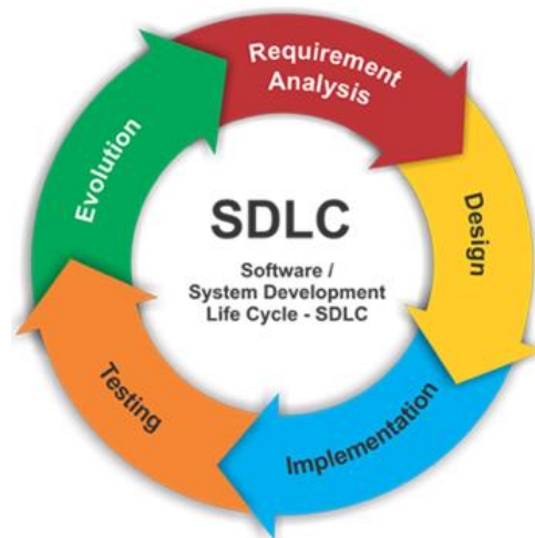
Figure 1. Software Development Life Cycle Models [11]

The method used in the development of information systems of this conference is the method of SDLC (System Development Life Cycle) Waterfall type consisting of 5 stages: Requirements, Design, Execution, Testing, and Release [8][9][10]. The flow of SDLC is generally shown in figure 1.