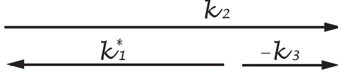
Figure 1. Kinematic configuration for three-point functions

(ii) momenta of the second and the third particles,